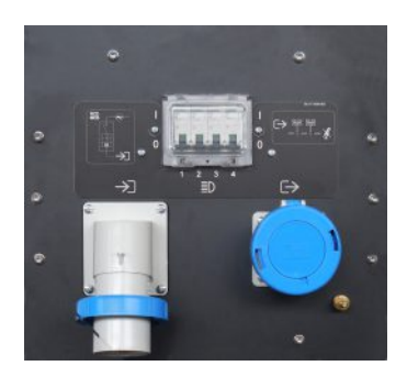
CONTROL PANEL With "Link" kit (additional outlet socket for connection in series)