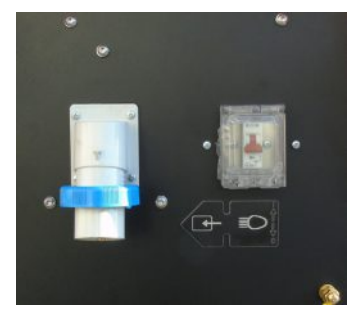
STANDARD CONTROL PANEL